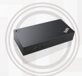
ThinkPad Thunderbolt 3 Dock

Lenovo reserves the right to alter product offerings and specifications at any time, without notice. Lenovo makes every effort to ensure accuracy of all information but is not liable or responsible for any editorial, photographic or typographic errors. All images are for illustration purposes only. For full Lenovo product, service and warranty specifications visit www.lenovo.com . Lenovo makes no representations or warranties regarding third party products or services. Trademarks: The following are trademarks or registered trademarks of Lenovo: Lenovo, the Lenovo logo, ideapad, ideacentre, yoga and yoga home. Microsoft, Windows and Vista are registered trademarks of Microsoft Corporation. AMD, the AMD Arrow logo and combinations thereof are trademarks of Advanced Micro Devices, Inc. in the United States and/or other jurisdictions. Other company, product and service names may be trademarks or service marks of others. Battery life (and recharge times) will vary based on many factors including system settings and usage. Visit www.lenovo.com/lenovo/us/en/safecomp/ periodically for the latest information on safe and effective computing. ©2016 Lenovo. All rights reserved.