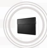
ThinkPad X1 Ultra Sleeve