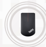
ThinkPad X1 Wireless Touch Mouse